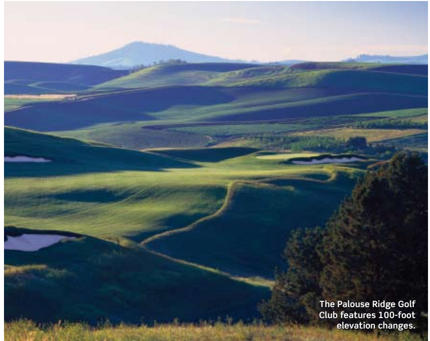
The Palouse Ridge Golf Club features 100-foot elevation changes.